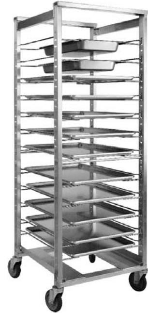
207-UA-13A (Pans not included)